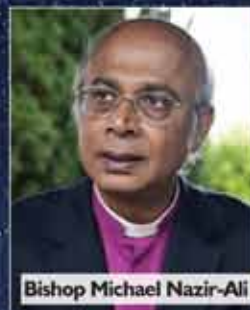
Bishop Michael Nazir-Ali