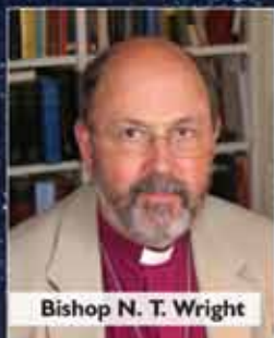
Bishop N. T. Wright

Charleston, South Carolina | Register Online | www.MereAnglicanism.com